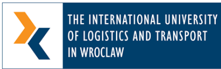
The International University of Logistics and Transport in Wrocław