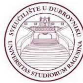
University of Dubrovnik